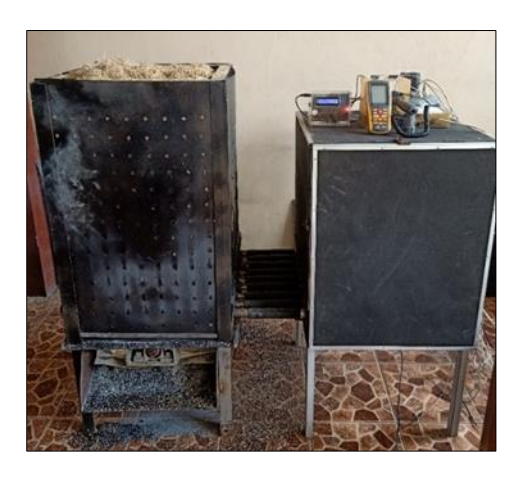
Figure 1 Model of rice husk energy conversion into thermal [19]

Energy conversion can be used to replace the direct combustion of biomass including rice husks. Direct burning of biomass is an easy and inexpensive way. Direct combustion is one of the main characteristics of biomass which makes it suitable as an energy source for converting plant waste into electricity [17] or direct combustion of biomass in boilers to generate heat at a residential level [18]. However, direct combustion has an impact on food, the environment as well as facilities and equipment. As an alternative, it can be used through the process of converting biomass into thermal. Energy conversion is carried out specifically for application to small farmers by utilizing furnaces and heat exchangers. This method has a significant impact on the increase in temperature and drying time of foodstuffs. In addition, in terms of feasibility, it gives satisfactory results. As in the research results [19, 20] which are presented in Figures 1 and 2.