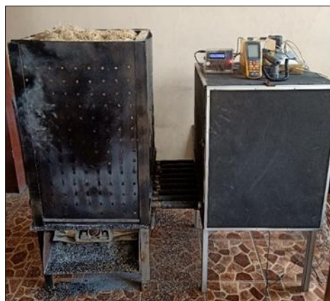
Figure 1 Model of rice husk energy conversion into thermal [19]

Energy conversion can be used to replace the direct combustion of biomass including rice husks. Direct burning of biomass is an easy and inexpensive way. Direct combustion is one of the main characteristics of biomass which makes it suitable as an energy source for converting plant waste into electricity [17] or direct combustion of biomass in boilers to generate heat at a residential level [18]. However, direct combustion has an impact on food, the environment as well as facilities and equipment. As an alternative, it can be used through the process of converting biomass into thermal. Energy conversion is carried out specifically for application to small farmers by utilizing furnaces and heat exchangers. This method has a significant impact on the increase in temperature and drying time of foodstuffs. In addition, in terms of feasibility, it gives satisfactory results. As in the research results [19, 20] which are presented in Figures 1 and 2.